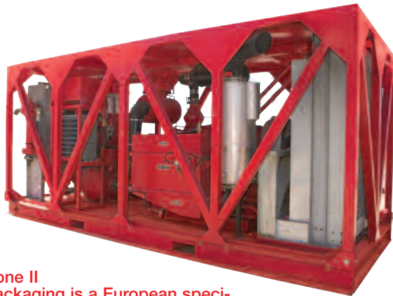
Zone II packaging is a European specification that requires temperature control, safety and shutdown equipment for offshore use.

HOLT Power Systems has the resources to properly size and CUSTOM PACKAGE POWER for your unique applications. With our qualified engineering staff, extensive fabrication facilities, skilled personnel and reliable product support, HOLT has what you need to get the most out of your power investment.